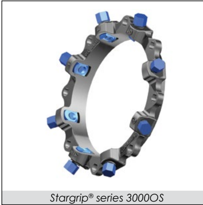
Stargrip® series 3000OS

Mechanical Joint Wedge Action Restraint for A, B, C & D Pit Cast Pipe