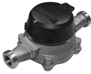
Model LP—5/8 in., 5/8 x 3/4 in.

Lead-Free Bronze Alloy, Models LP, 25, 35, 55, 70