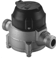
Model 25—5/8 in., 5/8 x 3/4 in.