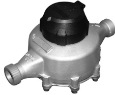
Model 55—1 in.