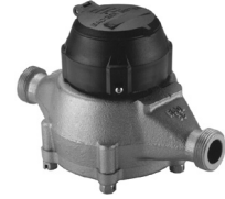
Model 35—3/4 in.