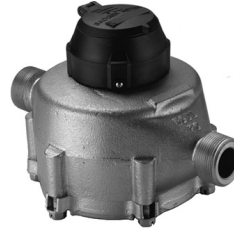
Model 70—1 in.